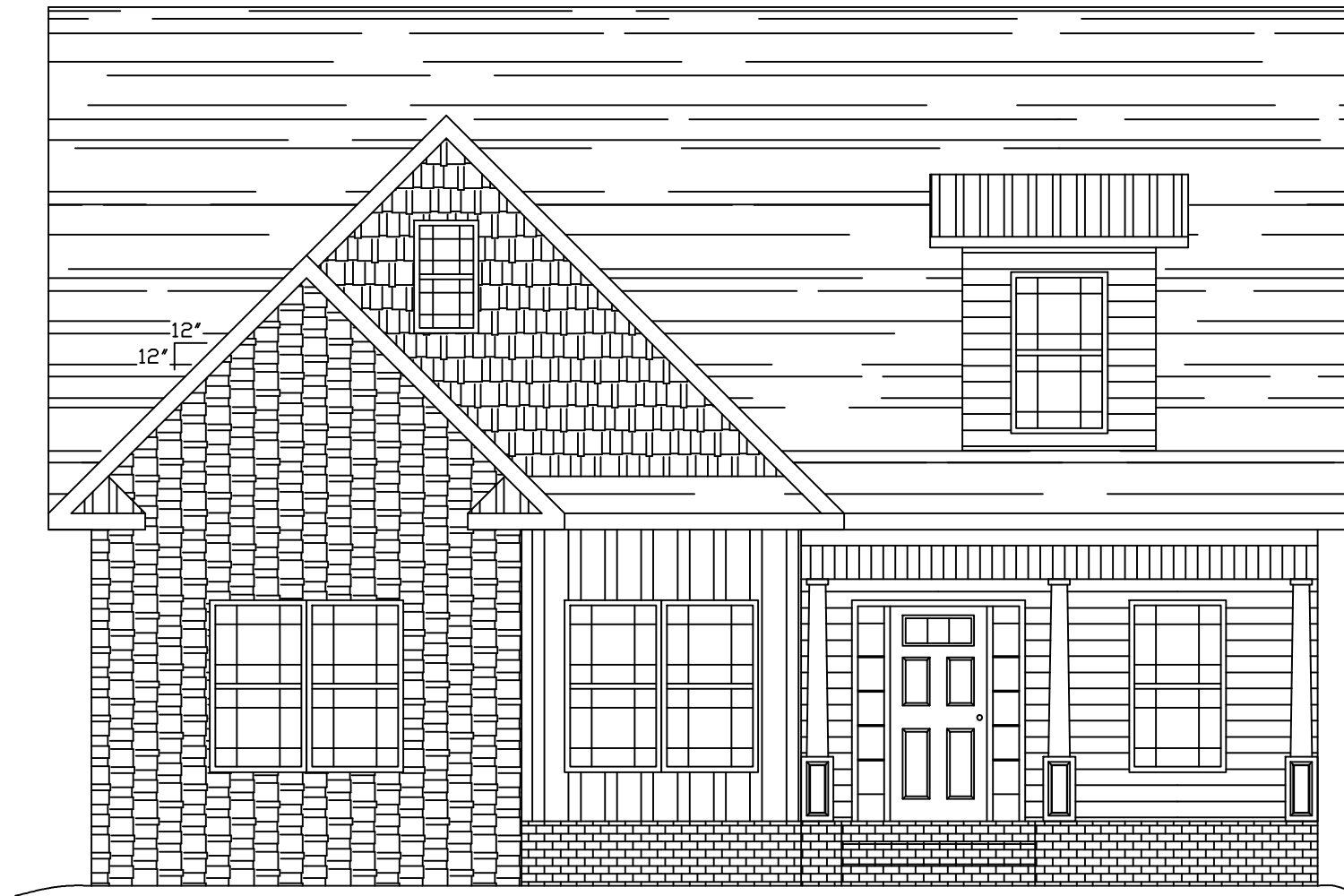
1 FRONT ELEVATION S-1.2 SCALE: 3/16"=1'-0"