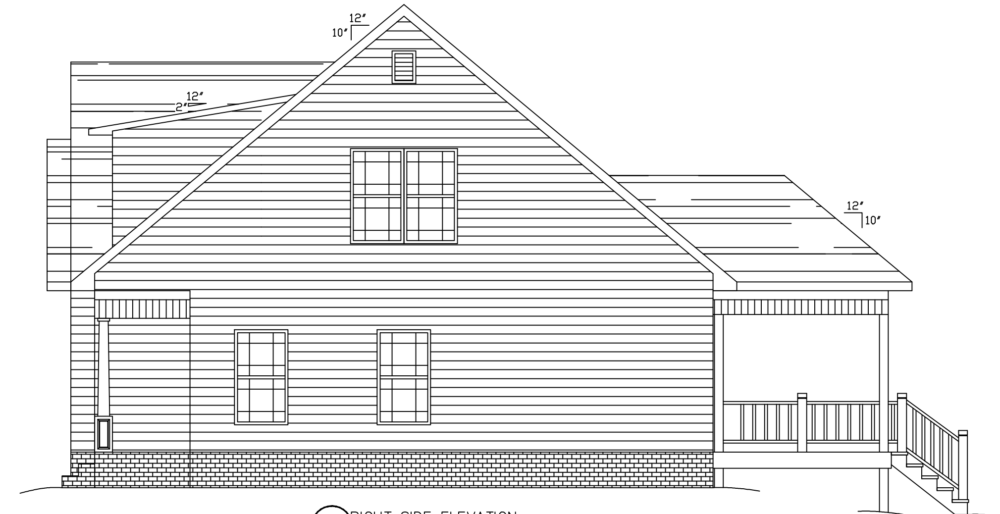
3 RIGHT SIDE ELEVATION S-1.2 SCALE: 3/16"=1'-0"