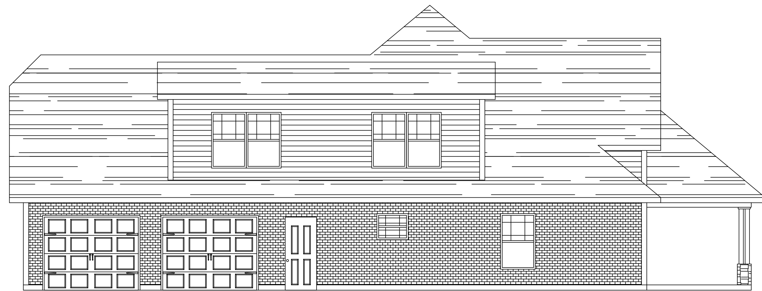
3 RIGHT SIDE ELEVATION SCALE: 3/16"=1'-0"