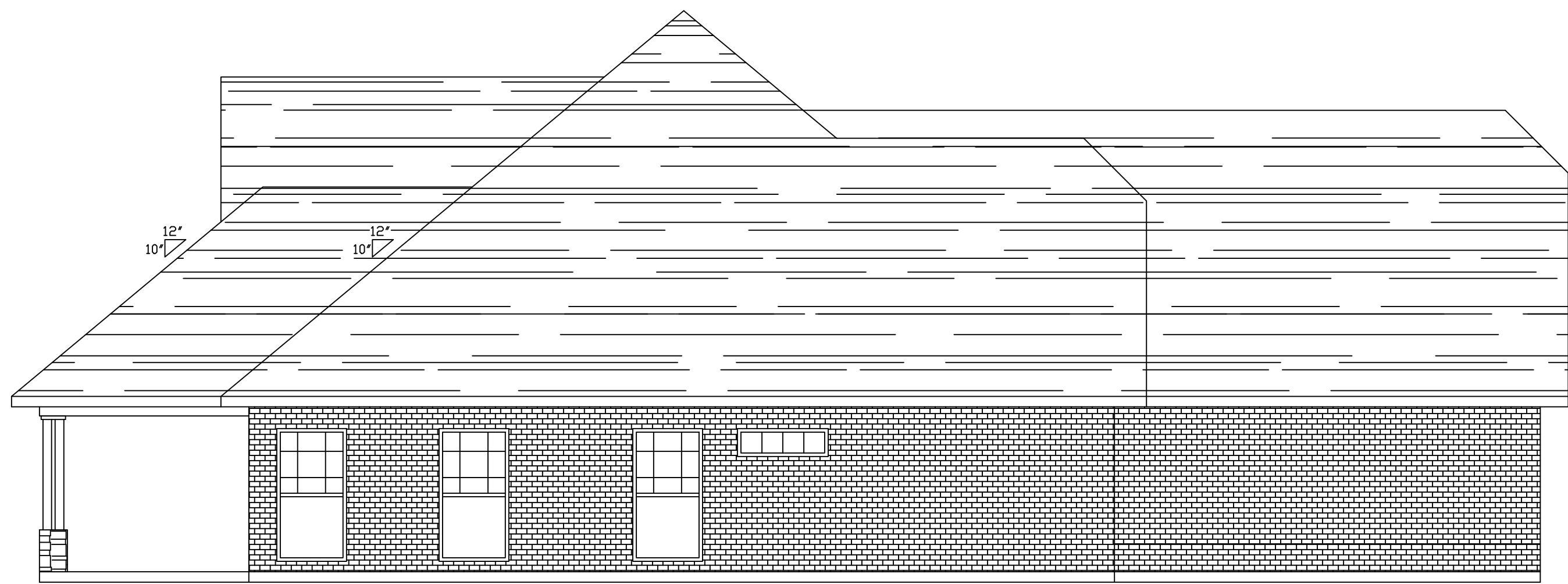
2 LEFT SIDE ELEVATION SCALE: 3/16"=1'-0"